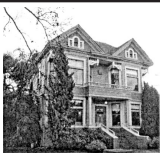
Kiely House - 1889