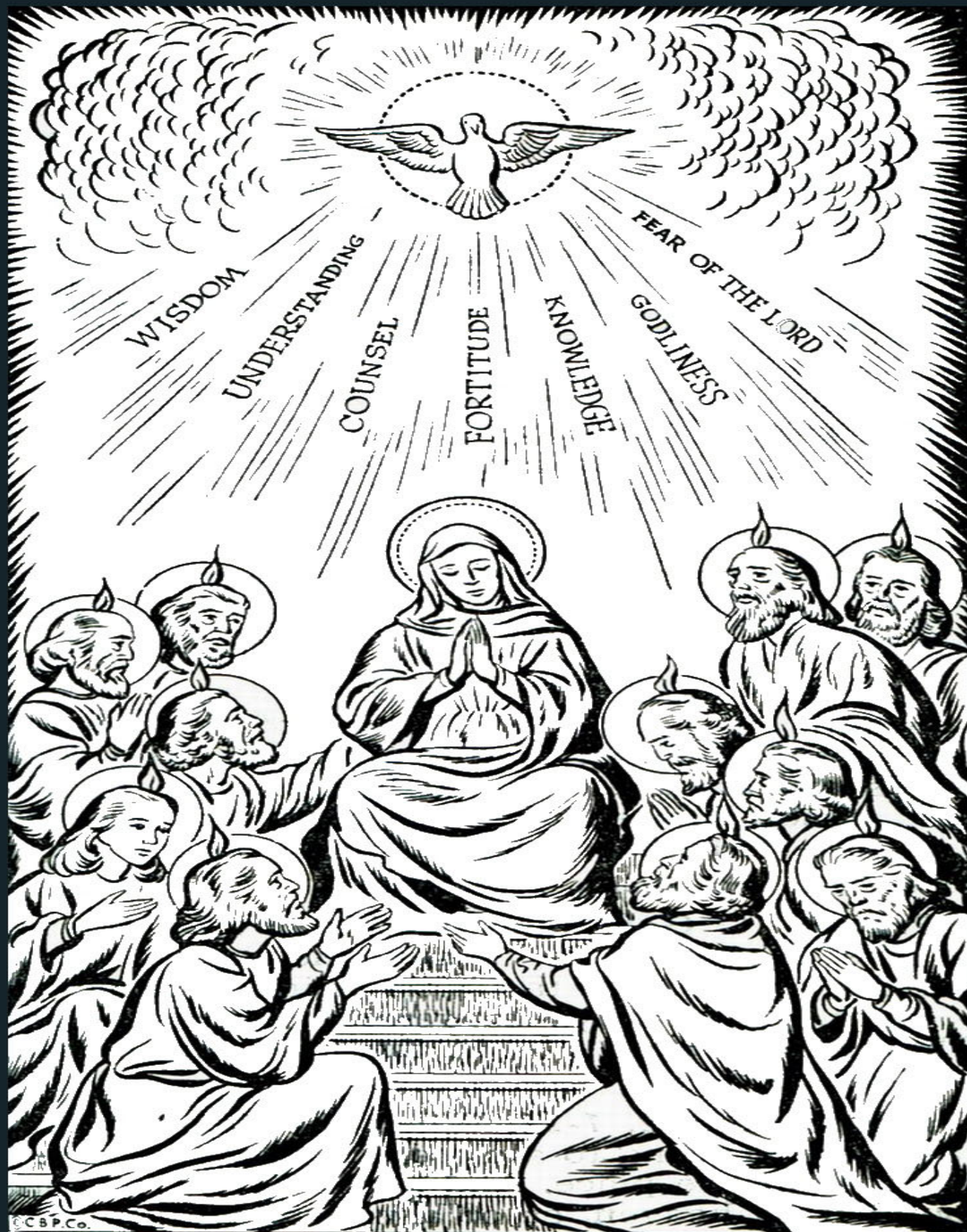
DESCENT OF THE HOLY SPIRIT