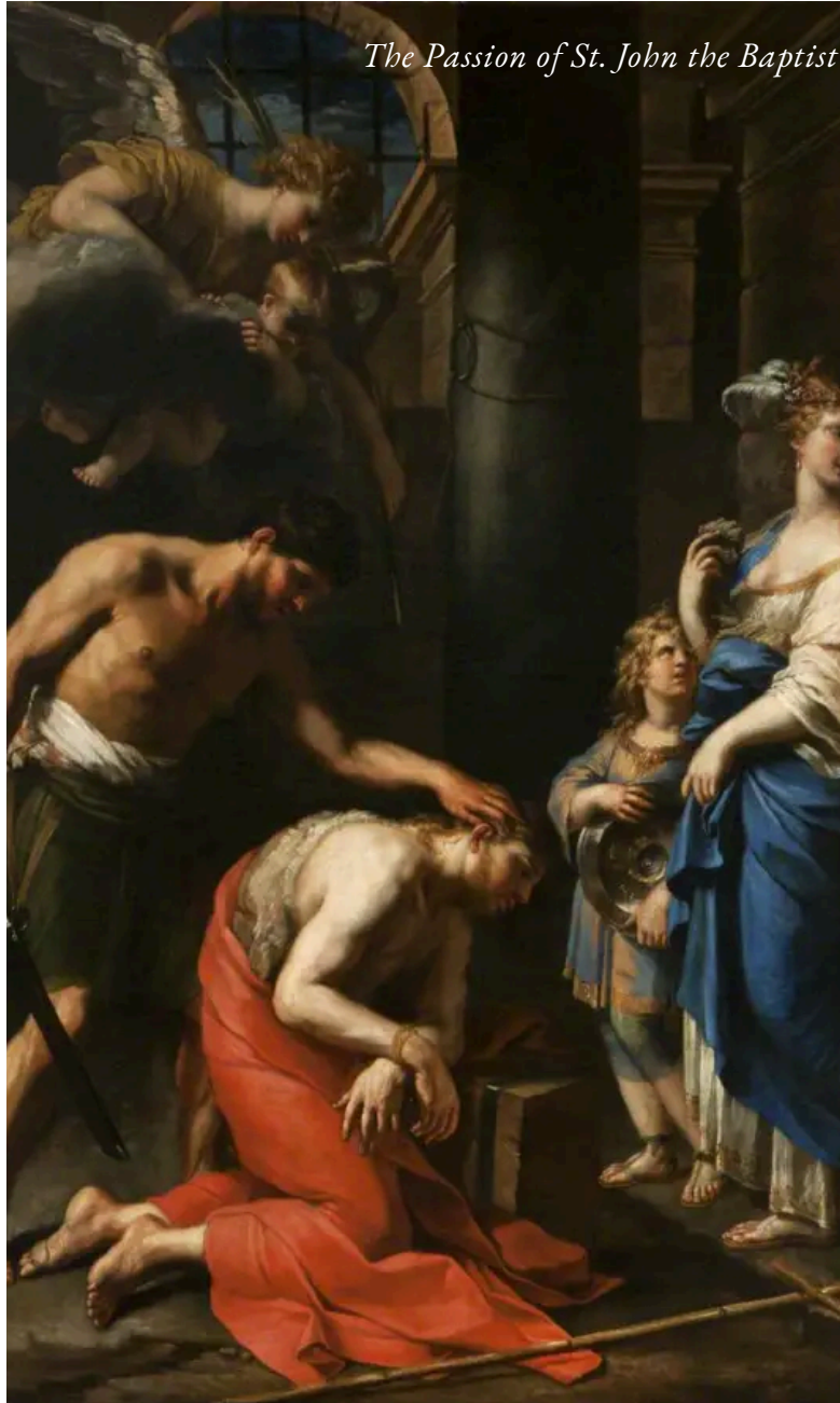
The Passion of St. John the Baptist