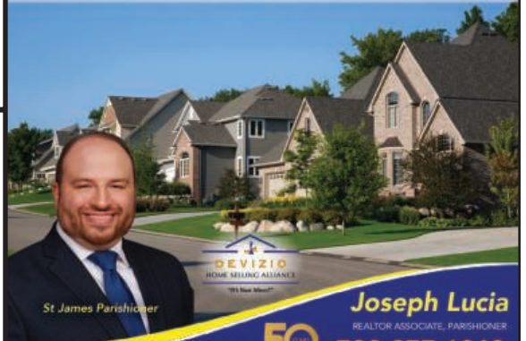
St. James Parishioner

I've joined the DeVizio Team, one of Central NJ's top Real Estate Teams to better serve you!