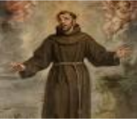
St. Francis -

St. Francis was the son of a wealthy merchant; he led a life of fun enjoying parties. When he was 20 years old he went off to war, dreaming of becoming a knight. He was captured by the enemy and became very ill in prison. After praying and contemplating Jesus’ words “Blessed are the poor in spirit, for the kingdom of heaven is theirs”, Francis was inspired to sell all that he had and follow Jesus. One day while praying in an old church he heard Jesus tell him to repair His church. Francis gave up everything he had to live like Jesus. He is the patron saint of animals and ecology. His feast day is October 4