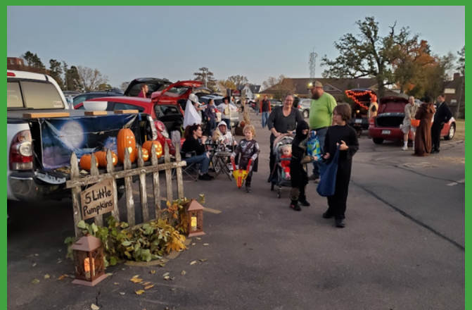
Our 1st Annual Trunk or Treat was a huge success