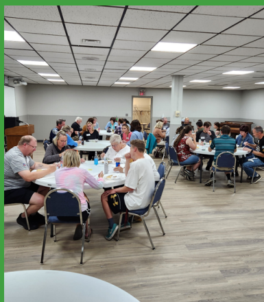
October Date Night was great