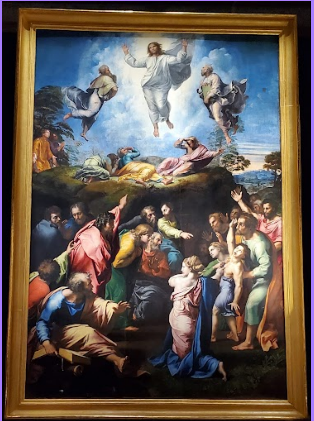
"The Transfiguration" by Raffaello Sanzio as seen in the Vatican Collection.