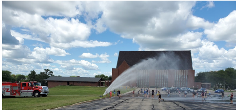
A staple of Totus Tuus is the end of the week water fight!