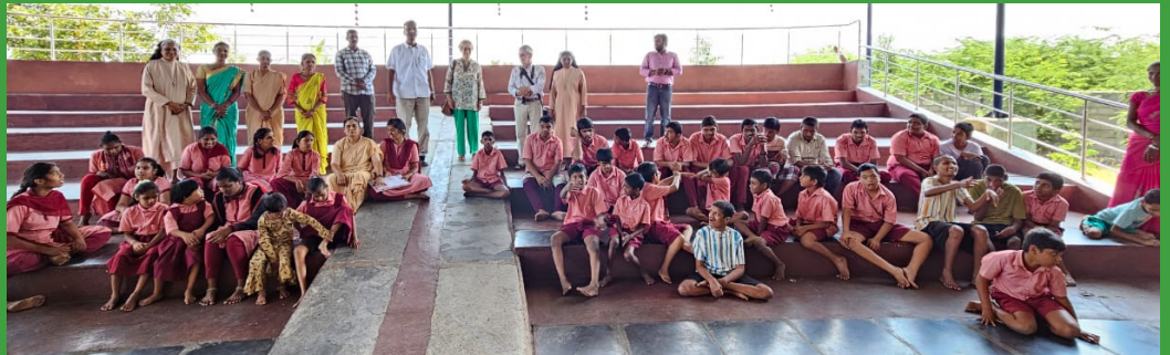
The children and teachers at the Vianney School. We are providing classrooms for mentally and physically challenged children, in the Diocese of Bellary, India.

Please notify parish office at least six months in advance to schedule wedding. Catholic party must show they are a "Catholic in good standing."