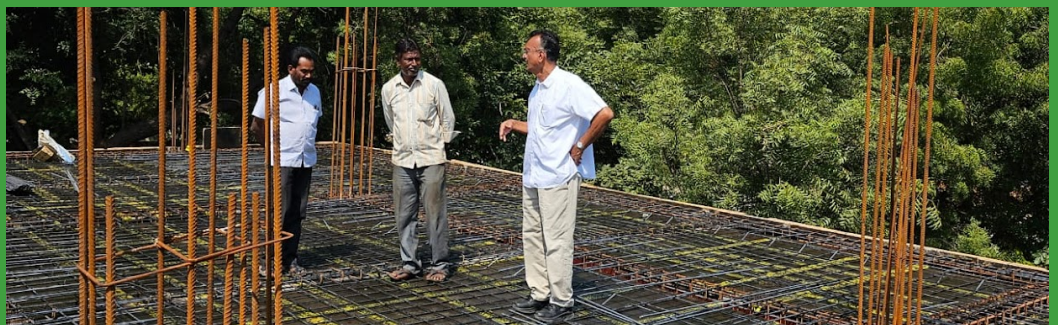
The new building with rebar, ready to pour concrete for the floor.