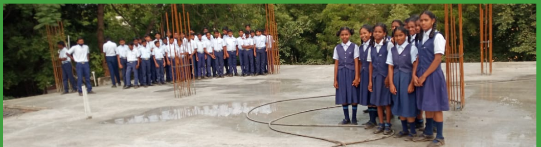
The Vianney School children stand on the completed roof of level one.