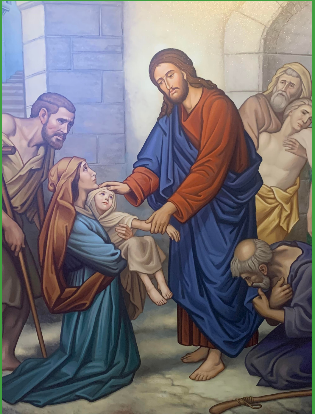
"The Divine Physician"