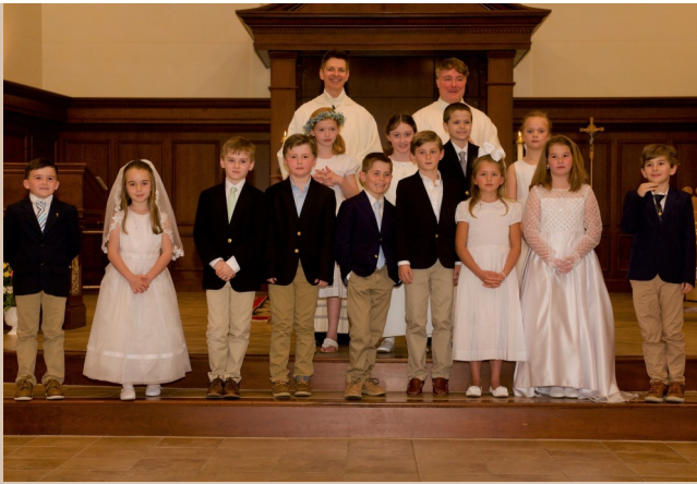
First Holy Communion Most Precious Blood Parish