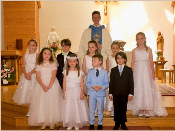
First Holy Communion St. Theresa of Lisieux Parish