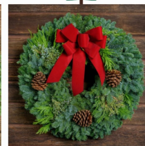
TRADITIONAL RED $35