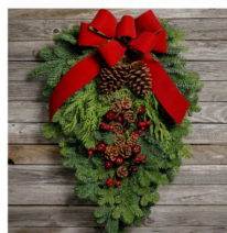
RED COUNTRY APPLE SWAG $35