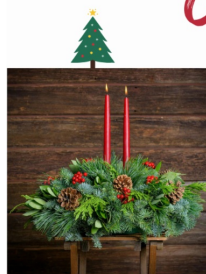
RED PACIFIC BAY CENTERPIECE $35