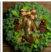
PREMIUM BURGUNDY $42