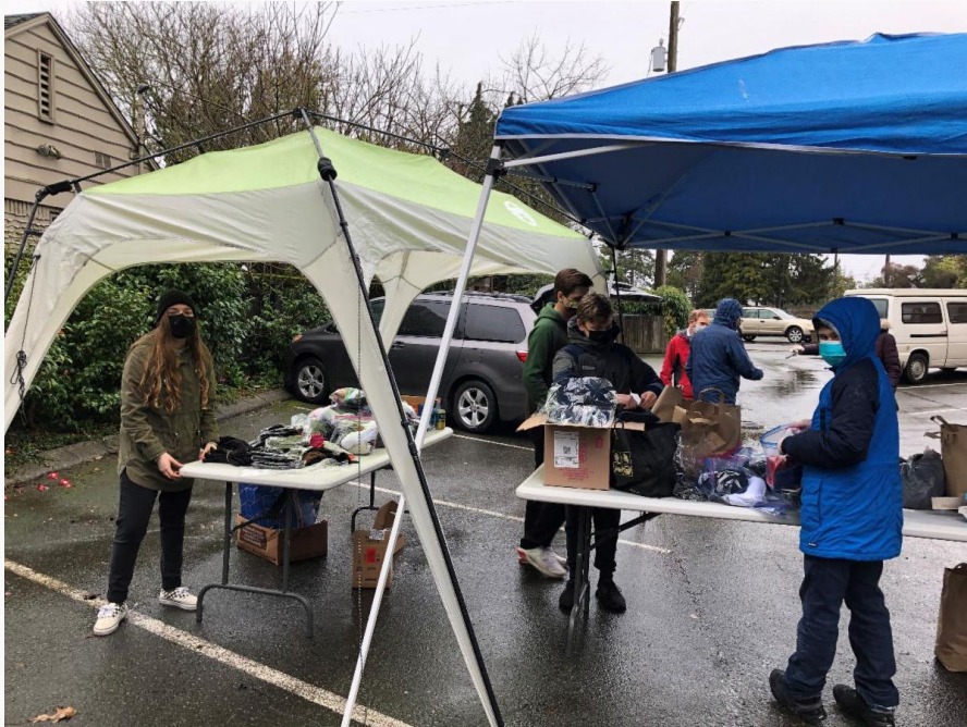
St. Pat's youth team creating survival kits for those experiencing homelessness