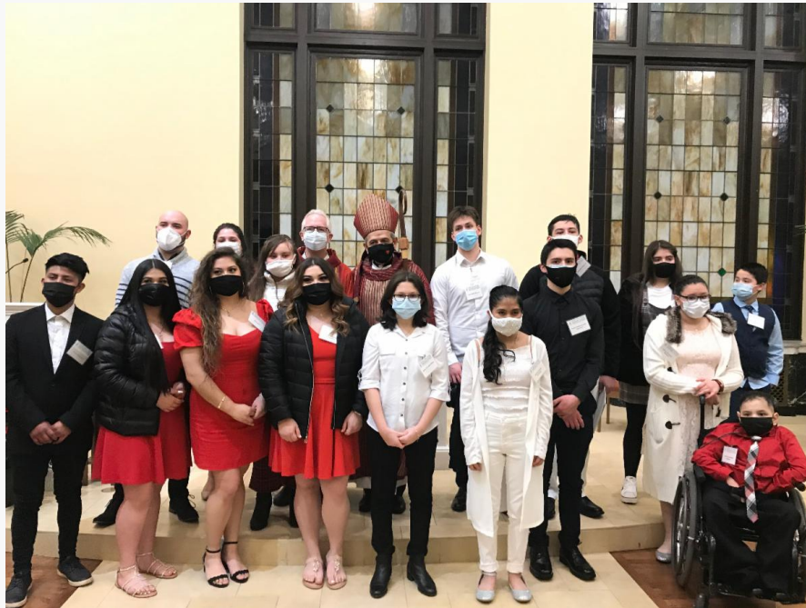
Our paired community confirmed 15 young people in an all Spanish language Confirmation this week at Christ Our Hope