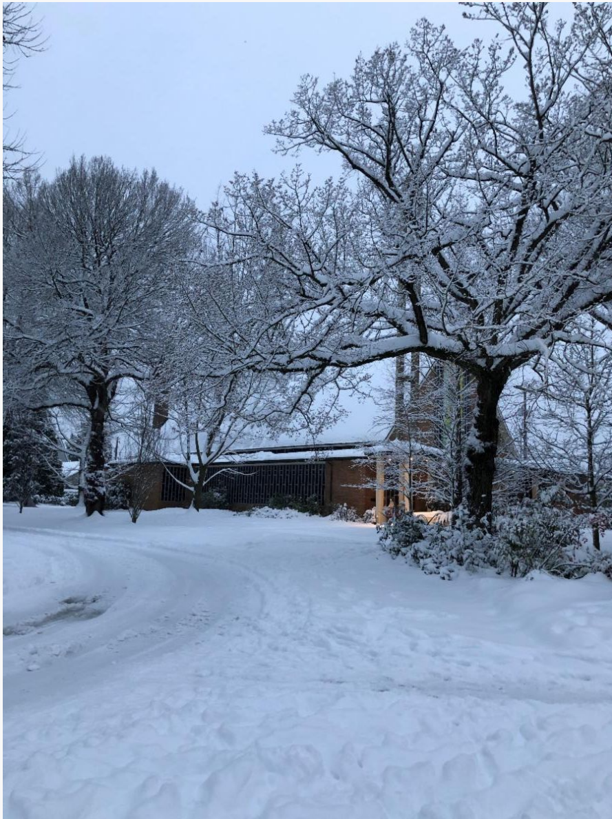
Quiet of the snowfall before Sunday Mass