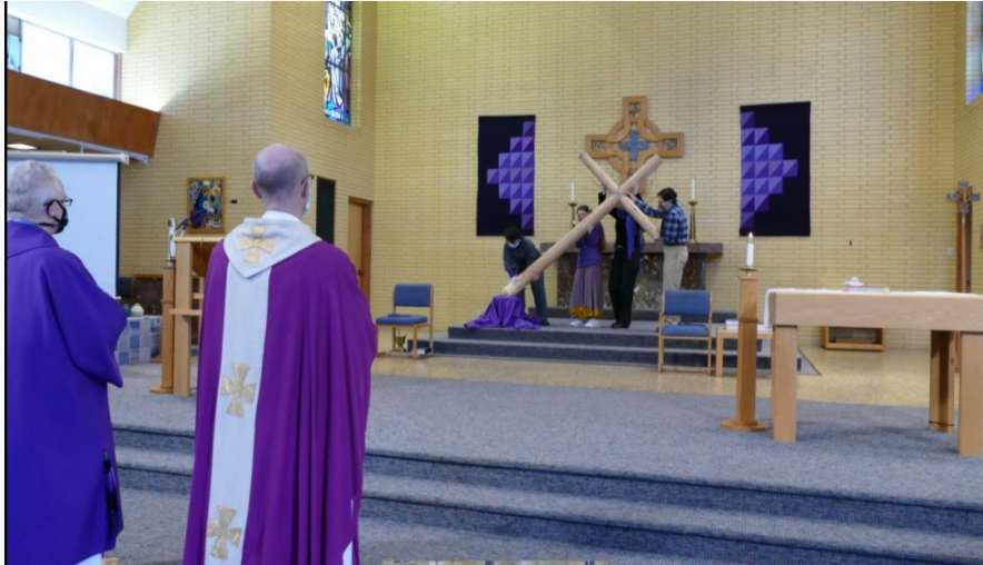
Sunday, February 20th 2021 - The First Sunday of Lent