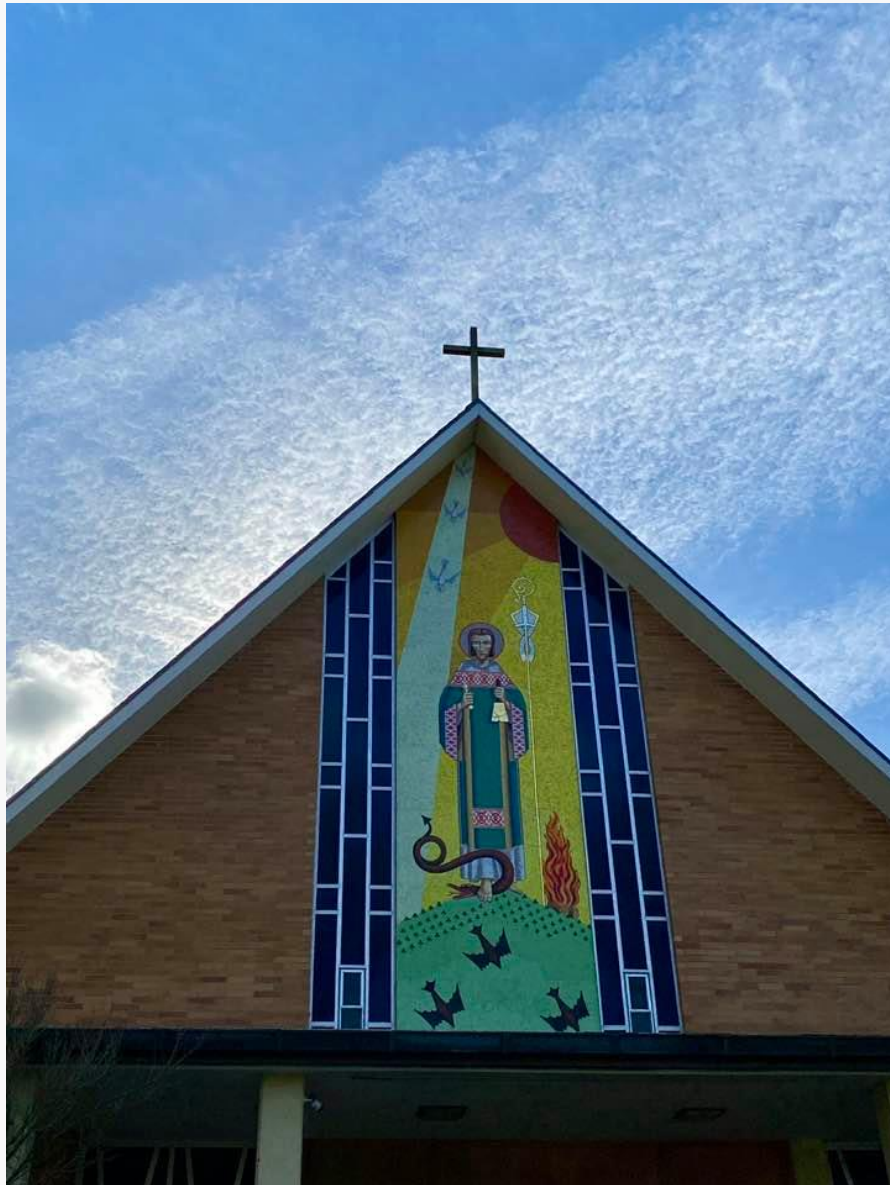
Almost Spring at St. Pat's