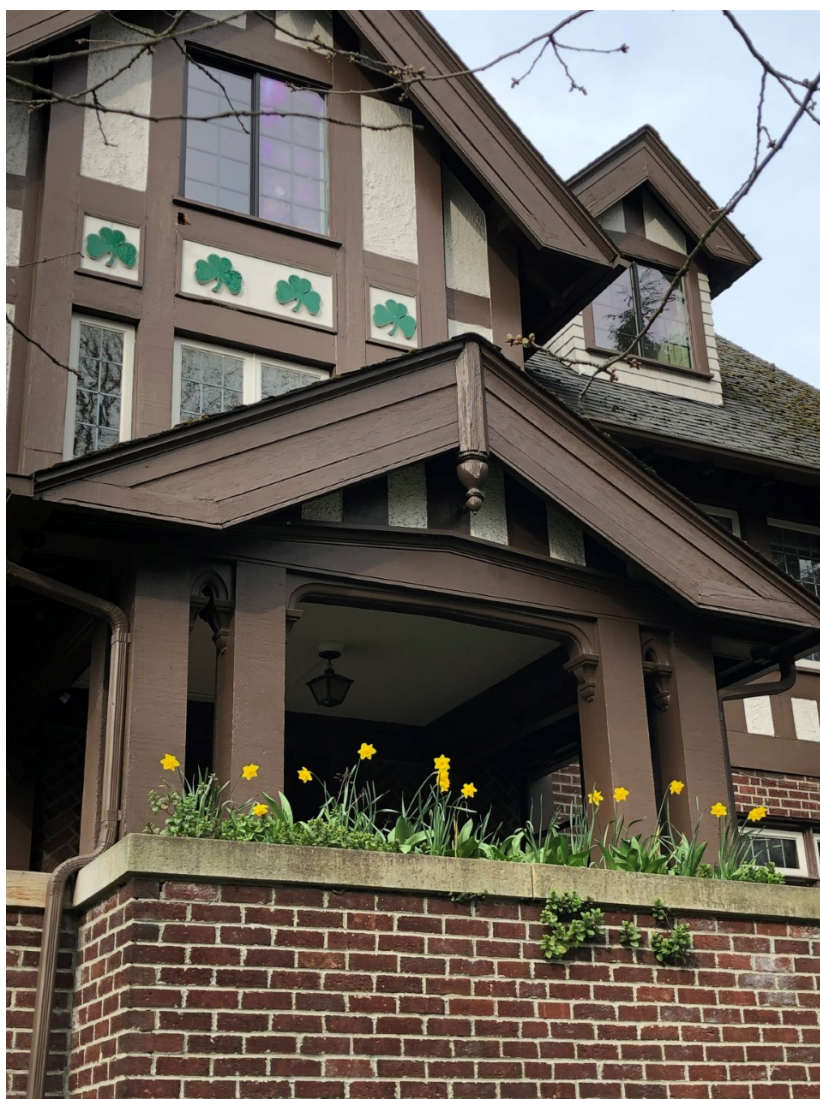
Spring at St. Patrick's Parish Center