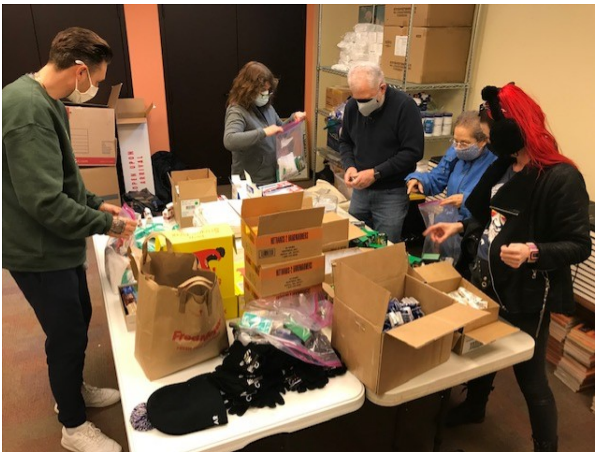
Volunteers from our Sacred Encounters Group preparing kits for the homeless

"Without death, there is no resurrection."