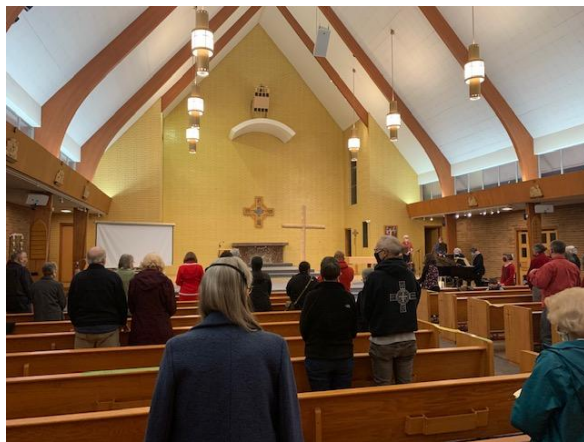
Good Friday of the Lord's Passion at St. Patrick's including parishioners from Christ Our Hope Catholic Church