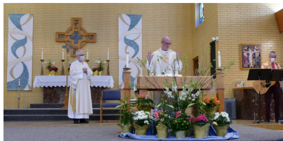
Easter Sunday Mass on April 4th 2021