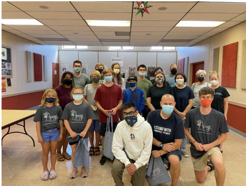
St. Pat's youth group preparing for Agape Project next month

"Lord, never let us lose our focus to carry out your mission."