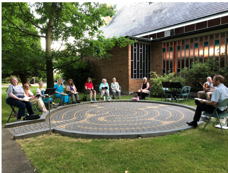
St. Pat's in-person choir practice at the labyrinth