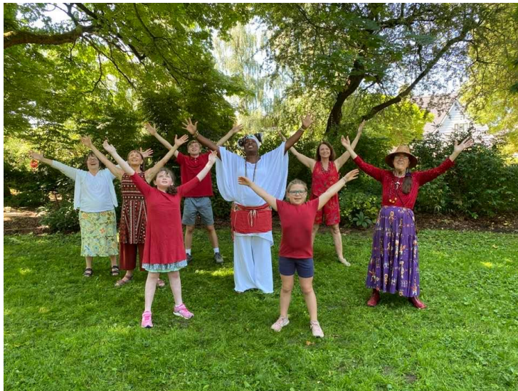
Dancing in Roanoke Park with a special guest