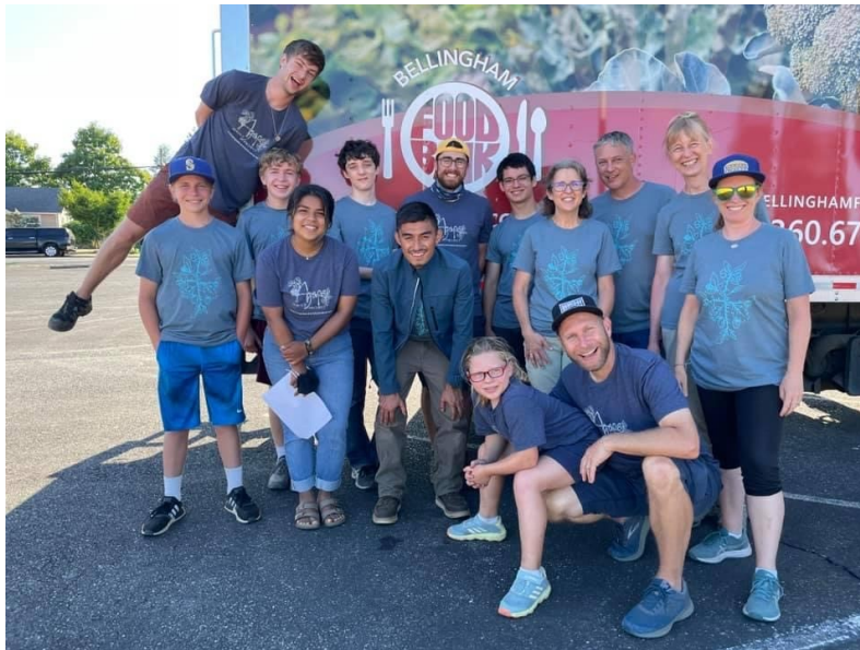
Youth Group Agape Family Service Project Week in Bellingham and Skagit County

When it comes to the Eucharist, we can always go deeper.