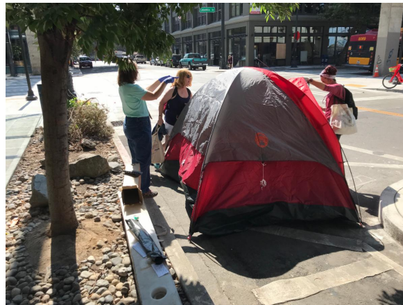
The Sacred Encounters team helping a new neighbor living unhoused to build his new home

"love God with all your heart, mind, and soul"