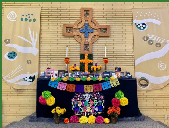
Altar de Los Muertos

Registration for Mass No Longer Required!