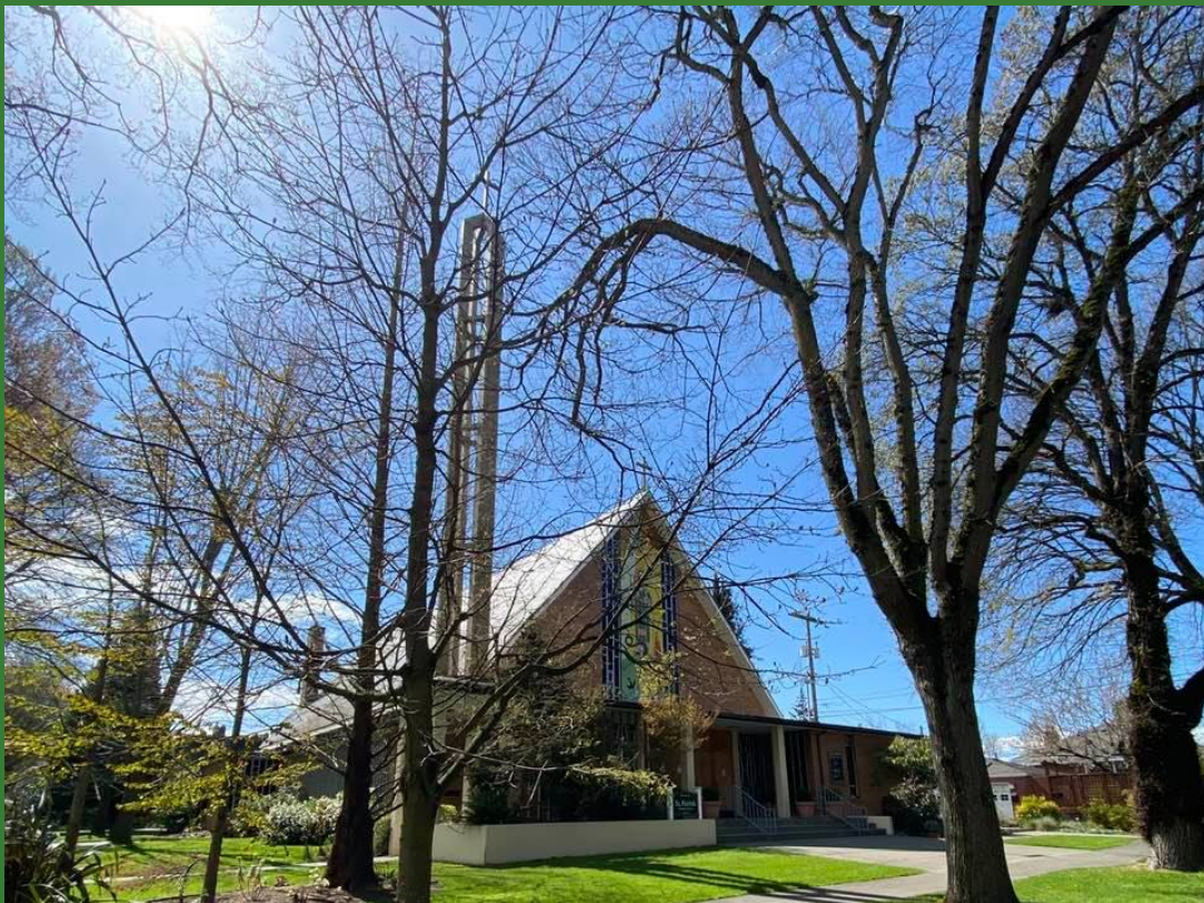
St. Pat's when the fog lifts

Complete Stewardship of Treasure Pledge HERE