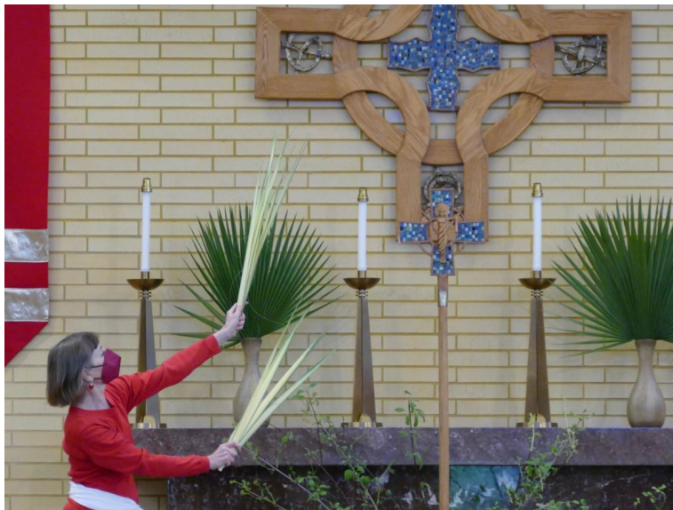
Palm Sunday at St. Patrick

Complete Stewardship of Treasure Pledge HERE