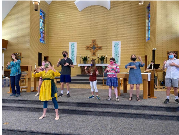
Movement Ministry in Motion

Our two parishes are so much alike in our Gospel perspective