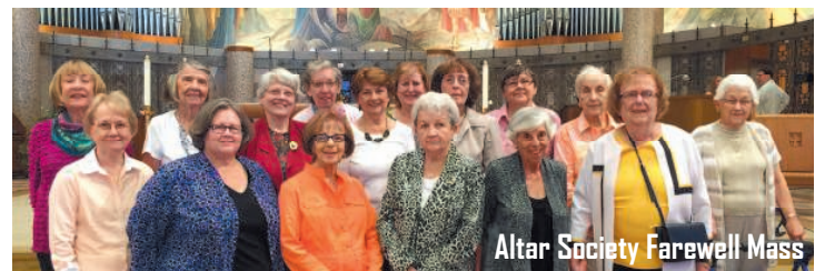
Altar Society Farewell Mass