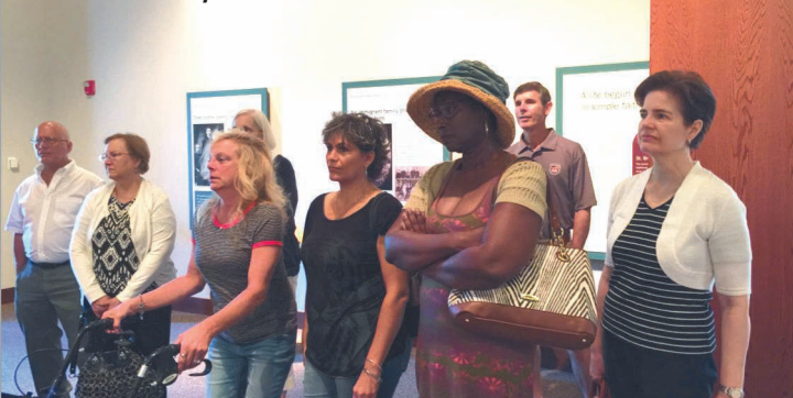
Fr. Solanus Casey Center visit