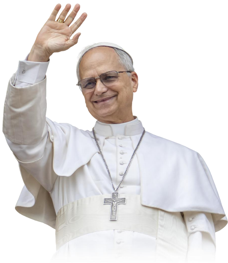
THE HOLY FATHER Pope Leo XIV