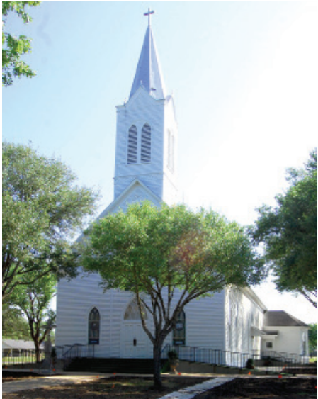
Immaculate Conception Church, St. Mary