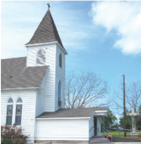
Ascension of Our Lord Church, Moravia