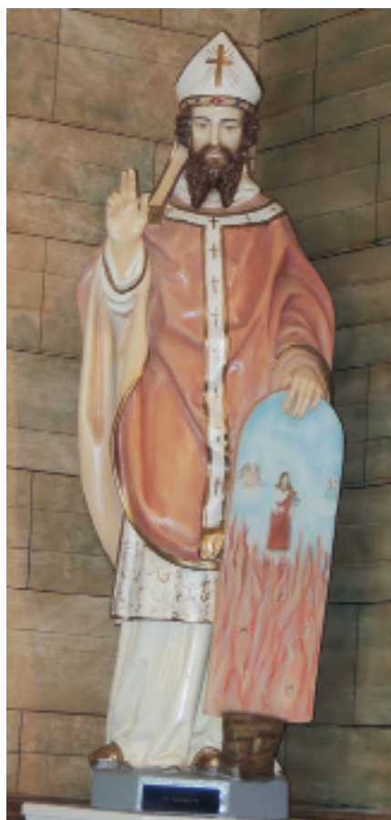
A statue of St. Methodius at Ascension of Our Lord in Moravia.