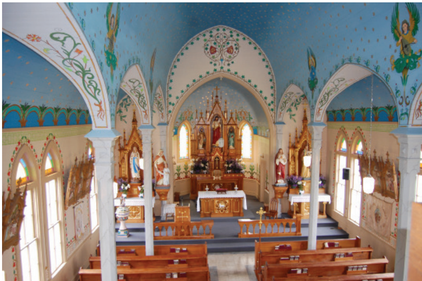
Sts. Cyril and Methodius Church in Dubina is one of the Painted Churches of Texas.