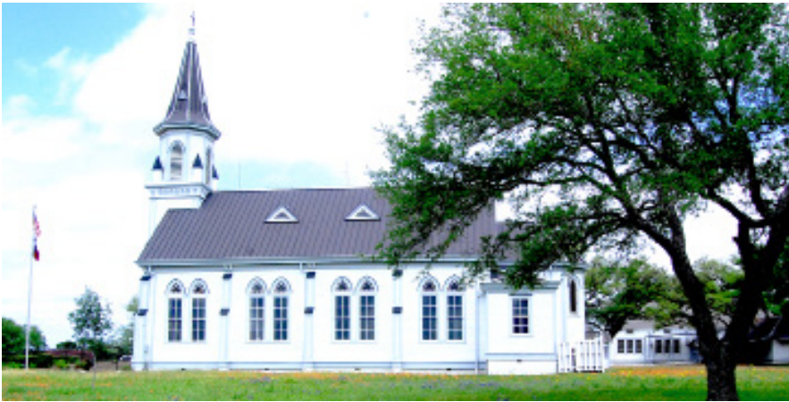
Sts. Cyril and Methodius Church, Dubina