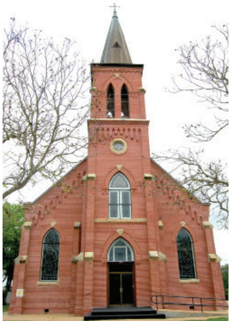
Nativity of the Blessed Virgin Mary Church, High Hill