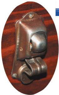
Ever wonder what these are in the old churches? They were used to hang the men’s hats.

The Schulenburg Chamber of Commerce provides guides for tour groups or individuals are welcome to enjoy a self-guided tour. For more information visit www.schulenburgchamber.org/painted-churches-tour .