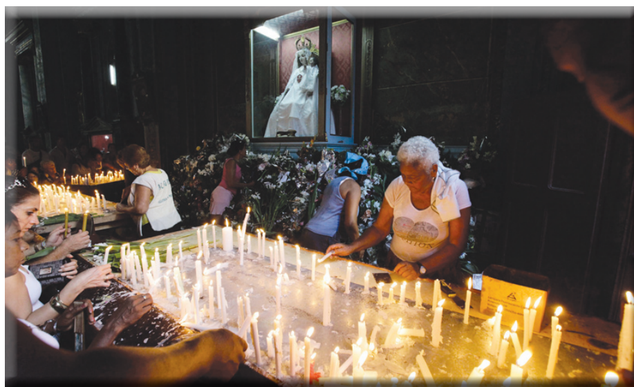
Women light candles near a statue of Mary, in her honor, at Merced Church in Havana, Cuba.