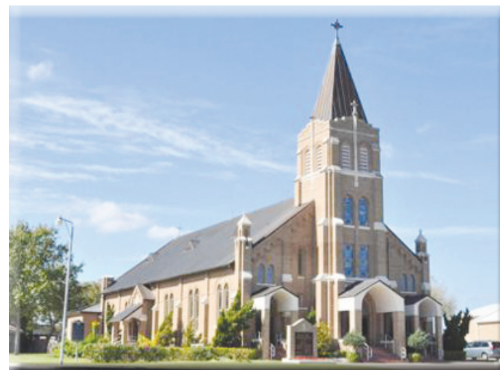
St. Joseph Church, Moulton