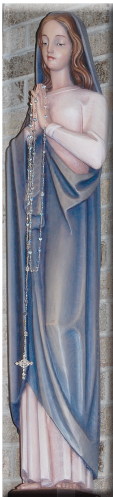
Statue of Mary at Holy Family Church, Victoria.

To watch Our Lady and Me , a video about devotion to Mary, visit www.usccb.org/media/ and click on the video link.