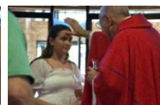
Gia Baptism, Holy Eucharist, Confirmation