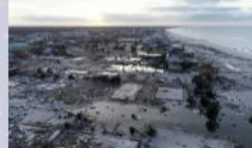
Devastation of Hurricane Michael - 2018

Men's Conference May 4 th 7:30 AM – 12:30