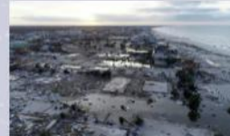
Devastation of Hurricane Michael - 2018

Men’s Conference May 4 th 7:30 AM – 12:30