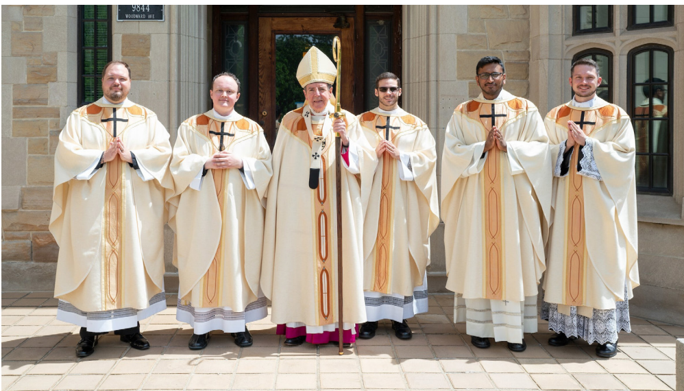
Five new priests ordained in Detroit May 27, 2023

The Archdiocese of Detroit is hosting this overnight event Aug. 5-6 at our Lady of the Fields in Brighton. The campout will include activities similar to what participating will experience at the Catholic festival being held in Lisbon, Portugal.