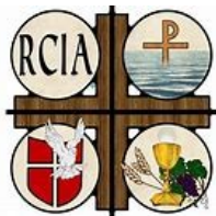
Rite of Christian Initiation for Adults

Help support our parish! Book sale will be on September 24-25 . For donations, please bring your books, puzzles, CDs and DVDs to the parish office, Monday-Thursday, 9:00AM- 2:00PM.