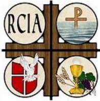
Rite of Christian Initiation for Adults

Help support our parish! Book sale will be on September 24-25 . For donations, please bring your books, puzzles, CDs and DVDs to the parish office, Monday-Thursday, 9:00AM- 2:00PM.