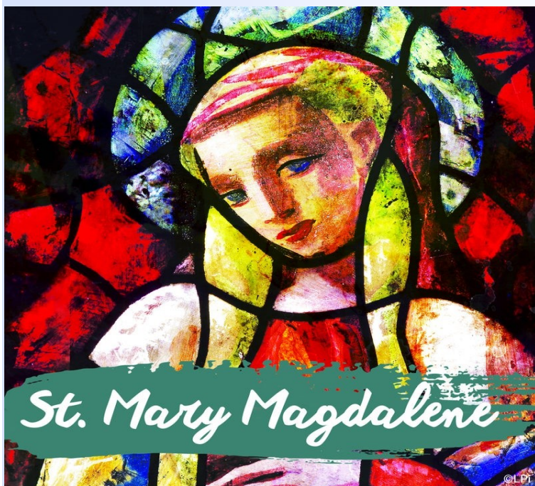
St. Mary Magdalene