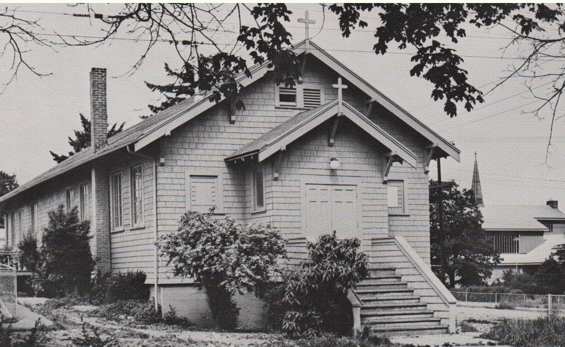
The little brown St. Rita Church. Behind is the current St. Rita Church. Photo taken in the 1960s.