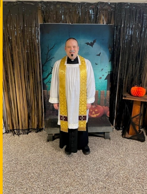
Meet St. Vincent de Paul