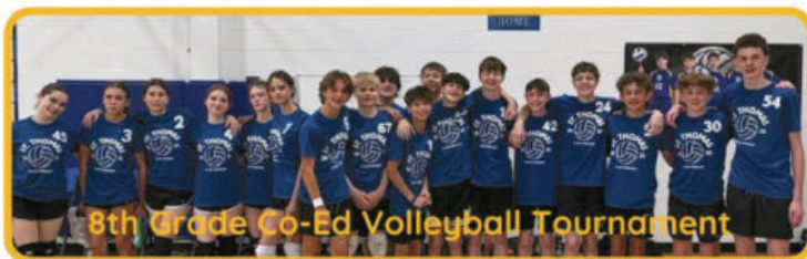
8th Grade Co-Ed Volleyball Tournament

Loving God, During the sacred season of Lent, bring me closer to you. Prepare a place in my home and heart for silence so I may pray without distraction. Help me to fast from those things that separate me from you. Help me to be generous to those in need. May this season rekindle my love and faith in you. Amen