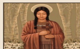
St. Kateri Tekakwitha Lily of the Mohawks

To set up your free account visit formed.org/signup and select our parish.