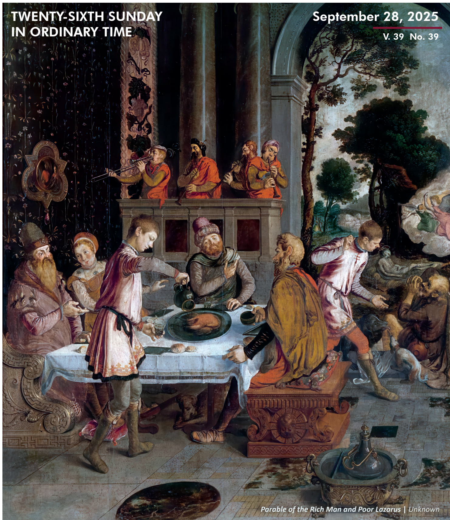
Parable of the Rich Man and Poor Lazarus | Unknown