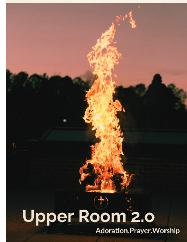
Upper Room 2.0 Adoration.Prayer.Worship