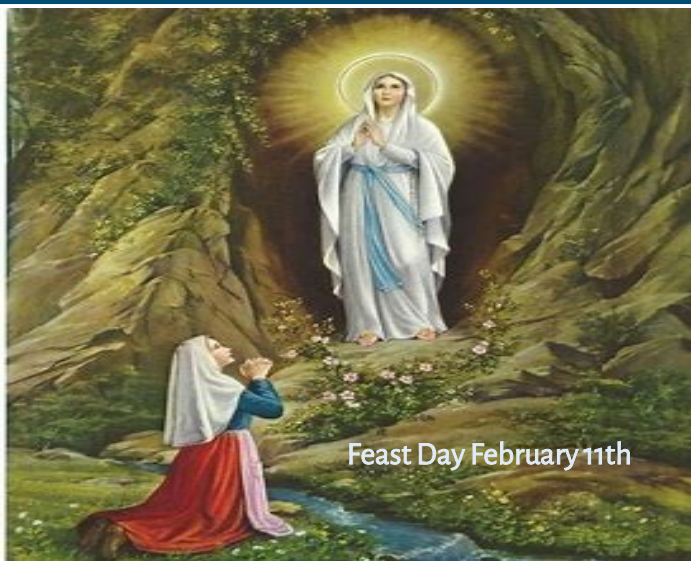
Feast Day February 11th