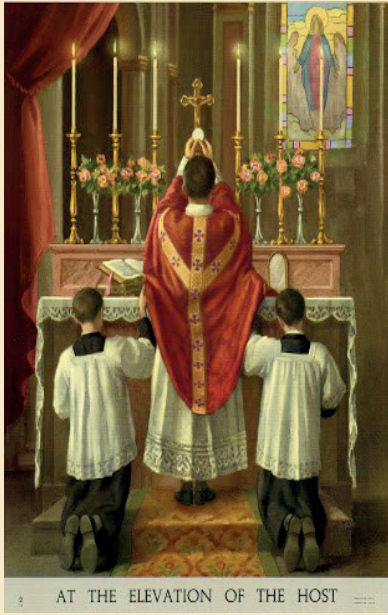
AT THE ELEVATION OF THE HOST

A Mass intention means that the sacrifice is offered for some person(s) living or dead. Also called the application of a Mass, it pertains to the ministerial fruits of the Mass. These fruits are both extensively and intensively finite in virtue of the positive will of Christ. Other things being