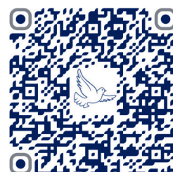
Catholic Charities Christmas Toy Drive