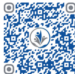
Mt. Carmel Guild Open-Choice Food Pantry

Scan the codes here to explore in-kind giving initiatives from Friends of St. Paul.