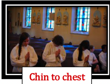
Chin to chest