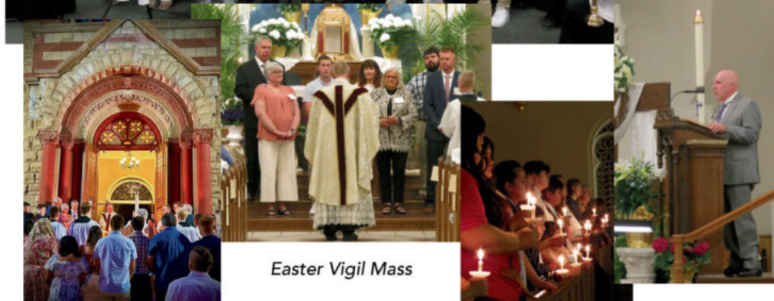
Easter Vigil Mass