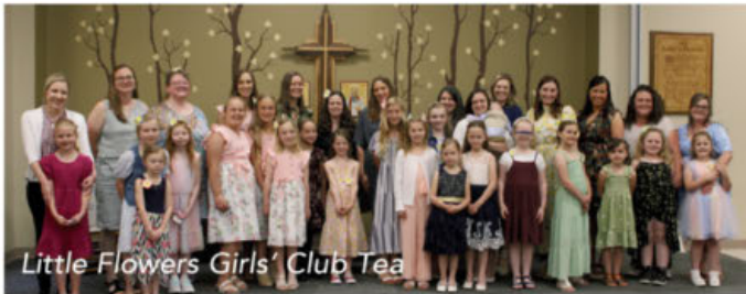
Little Flowers Girls' Club Tea