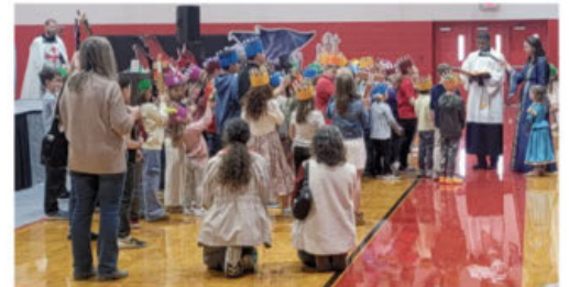
Dragon Slayers First Communion Retreat