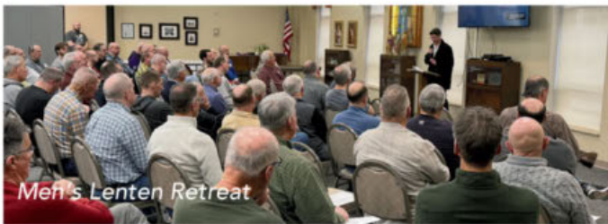
Men's Lenten Retreat