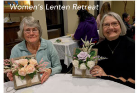
Women's Lenten Retreat