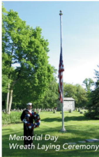
Memorial Day Wreath Laying Ceremony