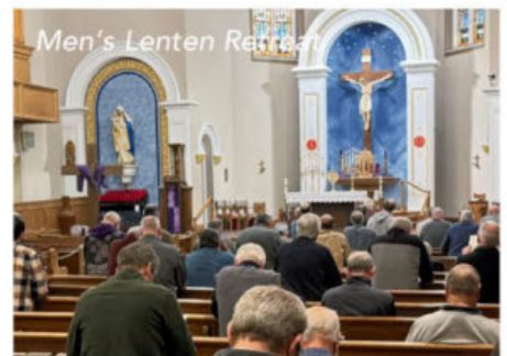
Men's Lenten Retreat