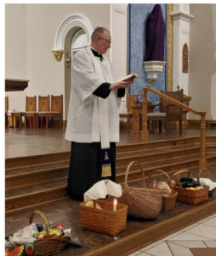
Blessing of Easter Foods Baskets