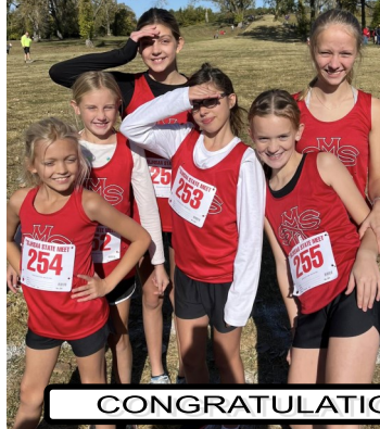
CONGRATULATIONS ST. MARY/TRINITY CROSS COUNTY TEAM!