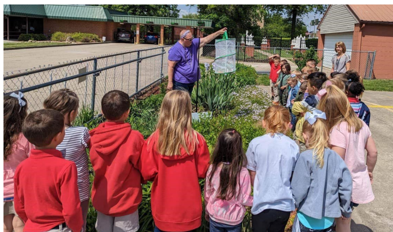
The Pre-K class has spent the last few weeks watching their caterpillars turn into butterflies. Last Friday, they had a butterfly release to introduce their butterflies into nature.