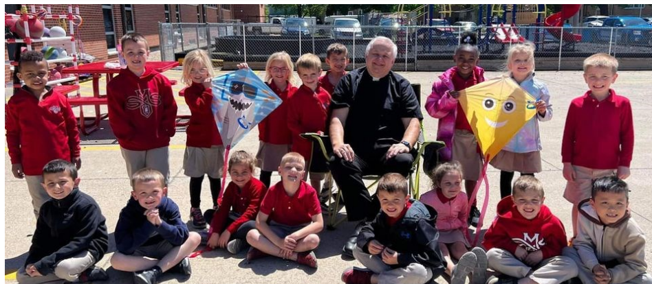
The letter K day four our alphabet countdown! Kindergarten spent some time outside this afternoon to learn how to fly kites. Father Steve joined for a little bit as well!